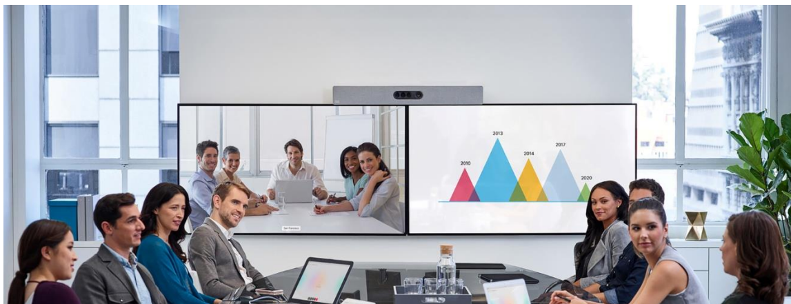
Figure 1. Cisco Webex Room Kit Plus in Large Conference Room

The Room Kit Plus - comprising a powerful codec and a quad-camera bar with integrated speakers and microphones* - is ideal for rooms that seat up to 14 people. It offers sophisticated camera technologies that bring speaker-tracking and auto-framing capabilities to medium to large-sized rooms. The product is rich in functionality and experience but is priced and designed to be easily scalable to all of your conference rooms and spaces - whether registered on the premises or to Cisco Webex.