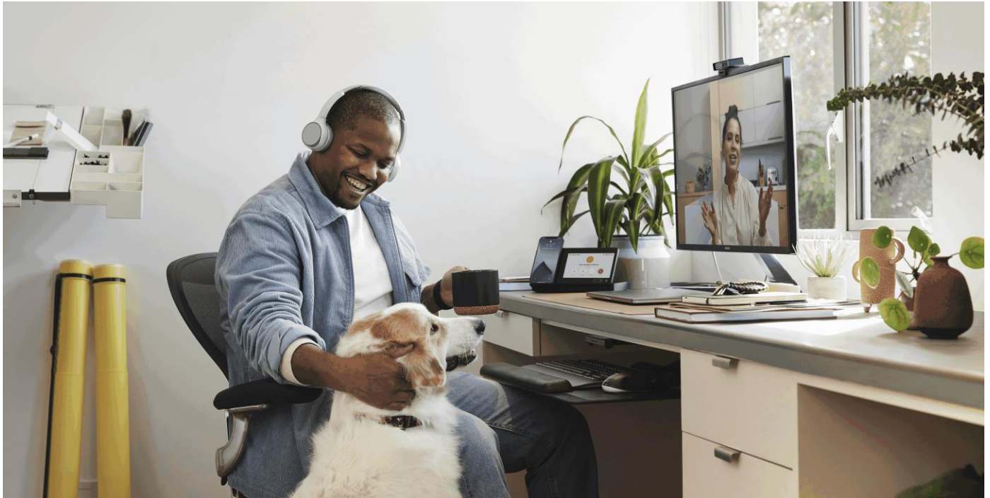
Above: Employee working from home using a Cisco Headset 730 and Webex Desk Camera

The Cisco® Headset 730 is a premium Bluetooth® headset built for business, personal, and the journey between.