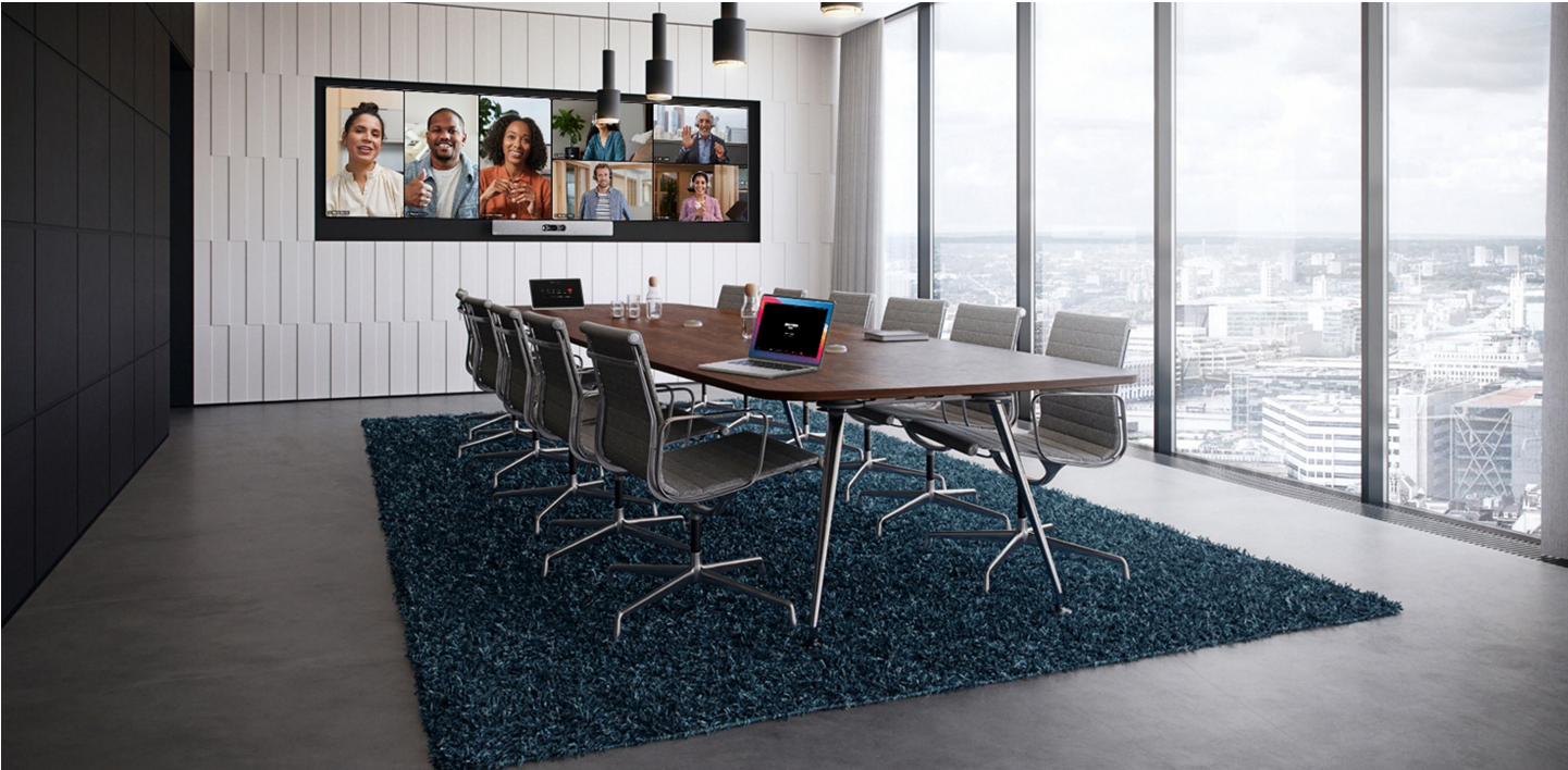
Figure 1. The Cisco Room Kit EQ in a conference room with the Quad Camera, the table-stand Room Navigator, and the Cisco Microphone Array

The Room Kit EQ provides optionality and extensibility with a highly modular setup to easily add touch controllers, cameras, speakers, microphones, and other room peripherals – easing the configuration and scaling of complex, multi-component audiovisual environments. This solution is rich in functionality and experience yet easy to deploy, maintain, and scale to your workspaces – and comes with unified cloud device management and workspace analytics in Control Hub.