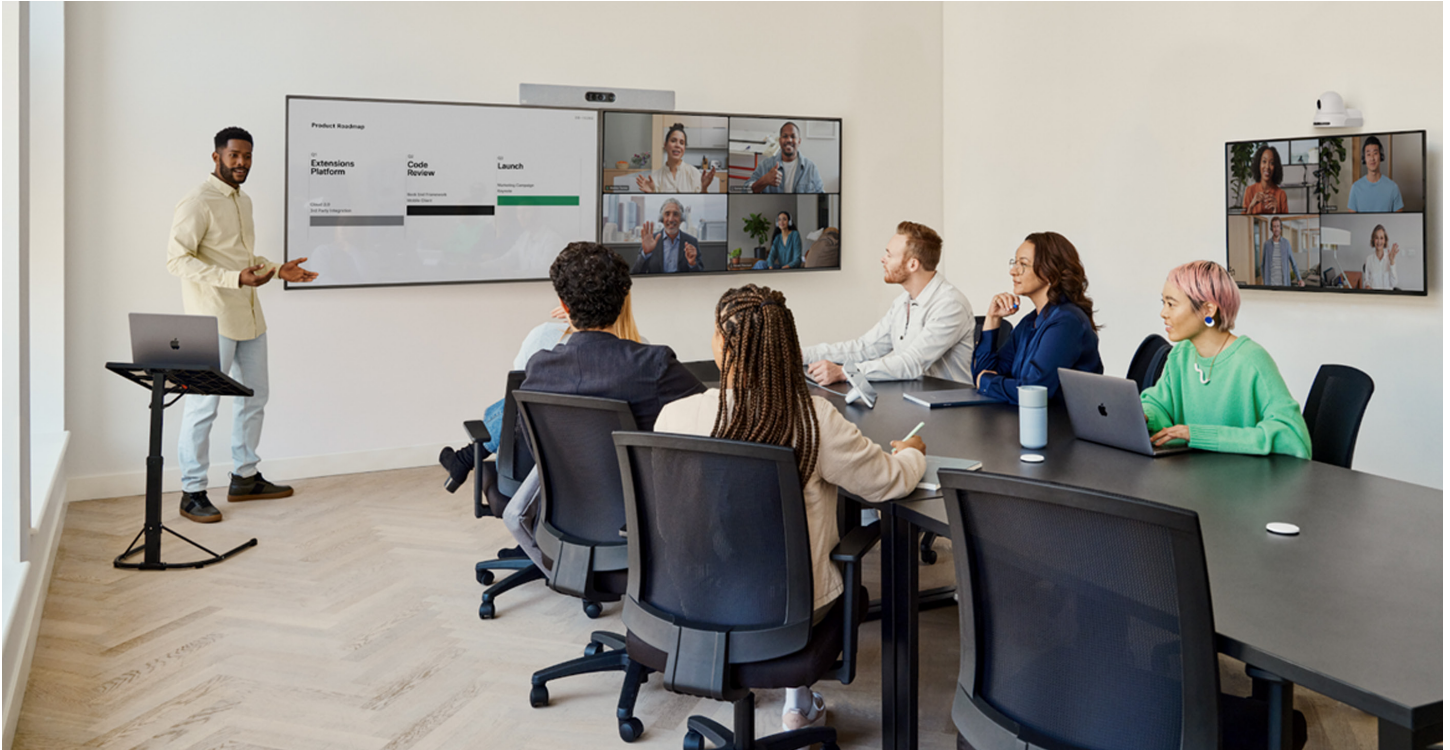
Figure 3. Cisco Room Kit EQ in a large training room featuring the Quad Camera, the PTZ 4K Camera, the Room Navigator touch controller, and Cisco table microphones