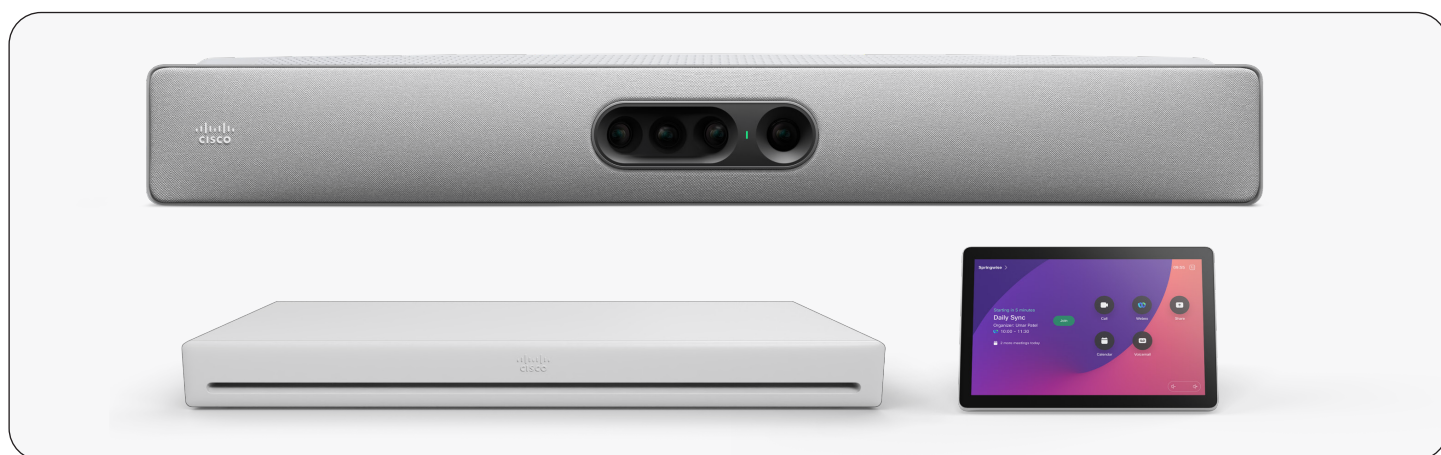
Figure 2. Main components of the Cisco Room EQ bundle: Cisco Codec EQ, Cisco Quad Camera, and the Cisco Room Navigator touch controller