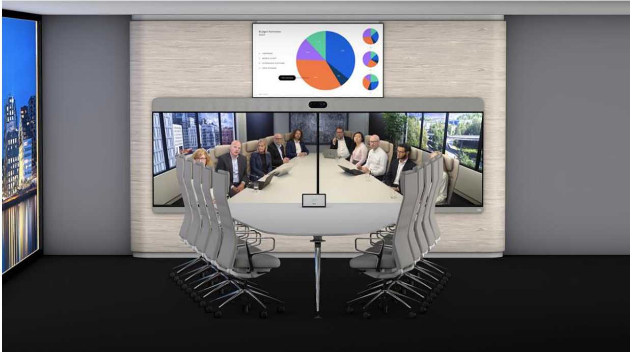
Figure 2. Point-to-point meeting in a large conference room