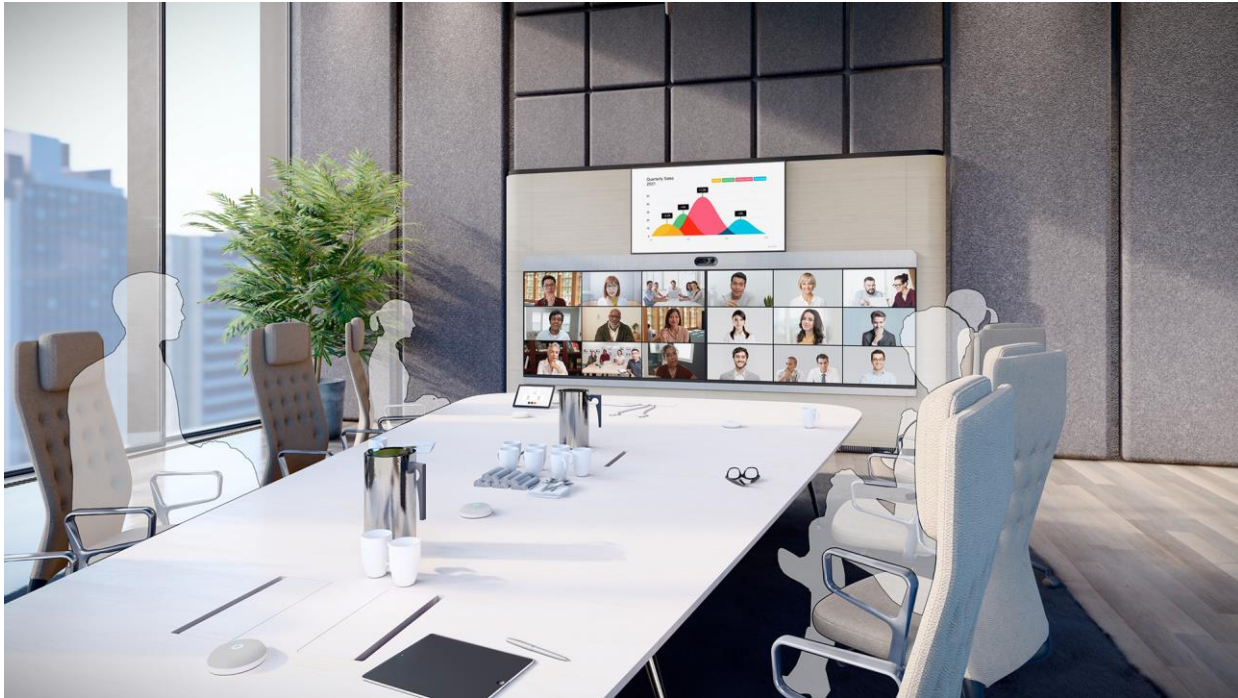
Figure 1. Multi-point meeting in an executive boardroom

The Room Panorama—comprising a powerful codec, a Cisco Quad Camera, dual 82-inch 8K video displays, and a 65-inch 4K presentation display—is ideal for rooms that seat up to 14 people. It offers sophisticated camera technologies that bring panoramic video, directional audio, speaker-tracking, and auto-framing capabilities to medium to large-sized rooms. The product is rich in functionality and experience and designed to be easily scalable to all your large conference rooms and spaces, whether registered on the premises or to the Webex cloud service.